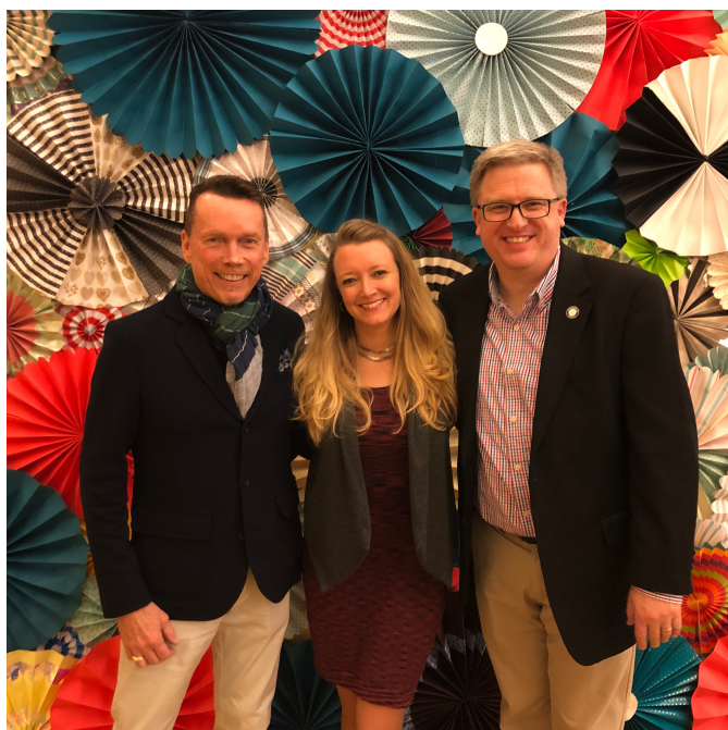
StudioFour8 at the "All In" Berkshire Hathaway HomeServices Convention.

Studio Four8 was founded with the unique idea that real estate Buyers and Sellers in Michigan's 48's deserve the highest level of personalized service, creative talent, and cutting-edge systems designed to make their entire experience truly exceptional.