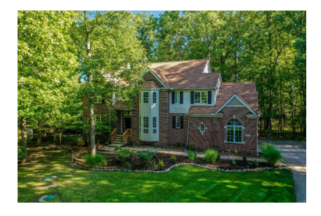
3692 Briarlee Way, Ann Arbor, MI 48103