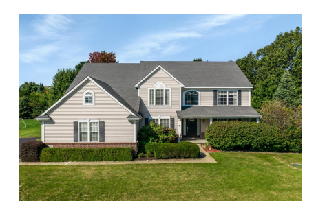
5510 Katz Farm Ct, Saline, MI 48176