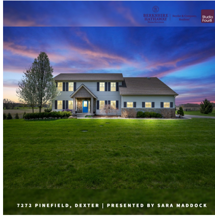
7272 Pinefield, Dexter MI 48130 Active