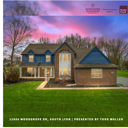
12900 Woodgrove Dr, South Lyon, MI 48178 Active