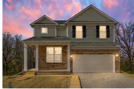
2847 Dillon Dr, Ann Arbor, MI 48105 Active