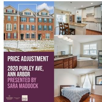
2820 Purley Ave, Ann Arbor, MI 48105 Active