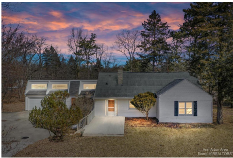
3700 Miller Rd ,Ann Arbor, MI 48103 Active