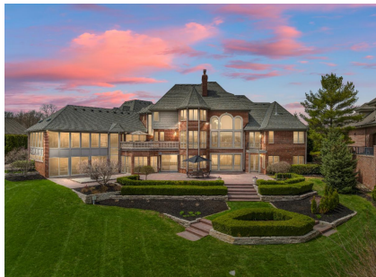
10721 Stoney Point Dr, South Lyon, MI 48178 Active