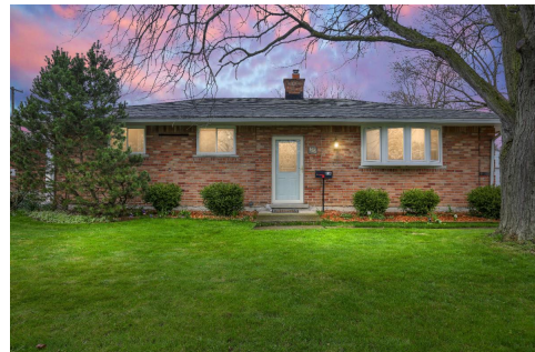
156 Ross Dr Monroe MI 48162 Pending