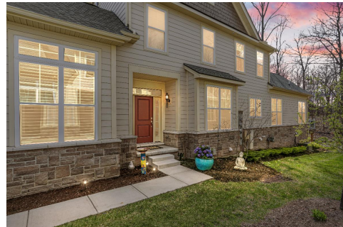
3020 N Spurway Dr, Ann Arbor, MI 48105 Active