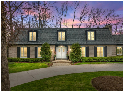
1341 Glendaloch Cir, Ann Arbor, MI 48104 Active