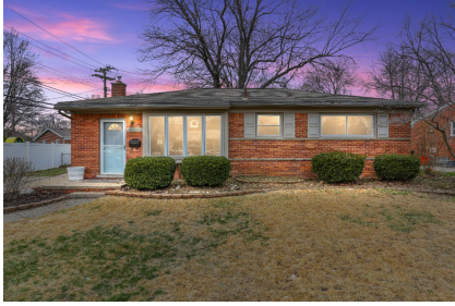
35133 Richland, Livonia, MI 48150 Pending